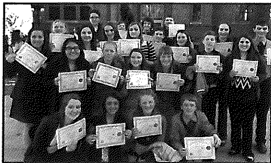
History Day Winners 5 Qualifying for Nationals 1 Win at Nationals