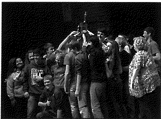
One-Act Play District Champions and State Runner-Up